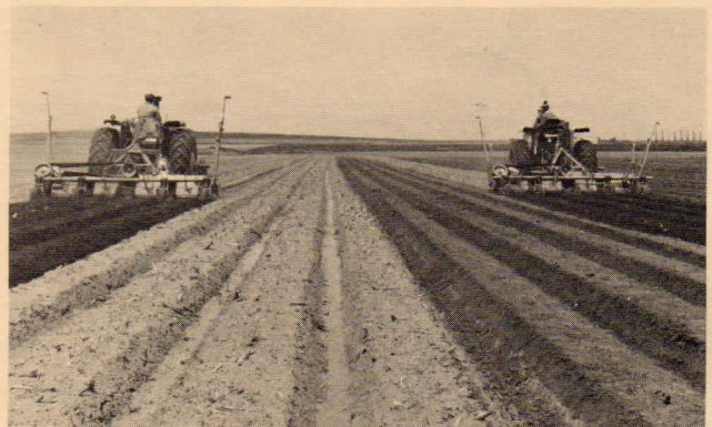
Here, two 4-row bedders are retilling and reforming beds in corn stubble field. The original beds were tilled and formed in the only previous operation.

NORTHWEST Rotary Tillers are available in sizes from 4' to 20' in width. The "RB" and "D" Series may be adapted for use in vineyards, row crop cultivation, strip tilling, hilling, chemical incor-