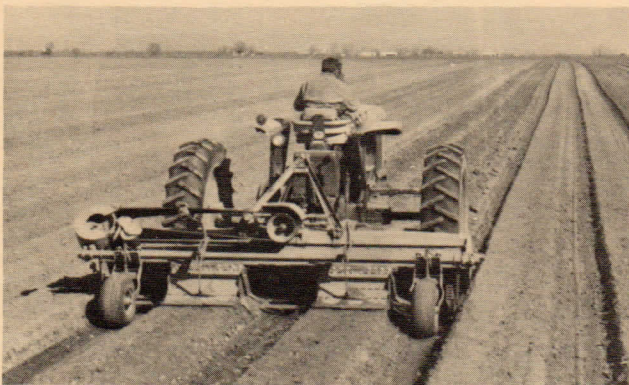
A two bed tiller is shown forming and tilling the top of the beds only.