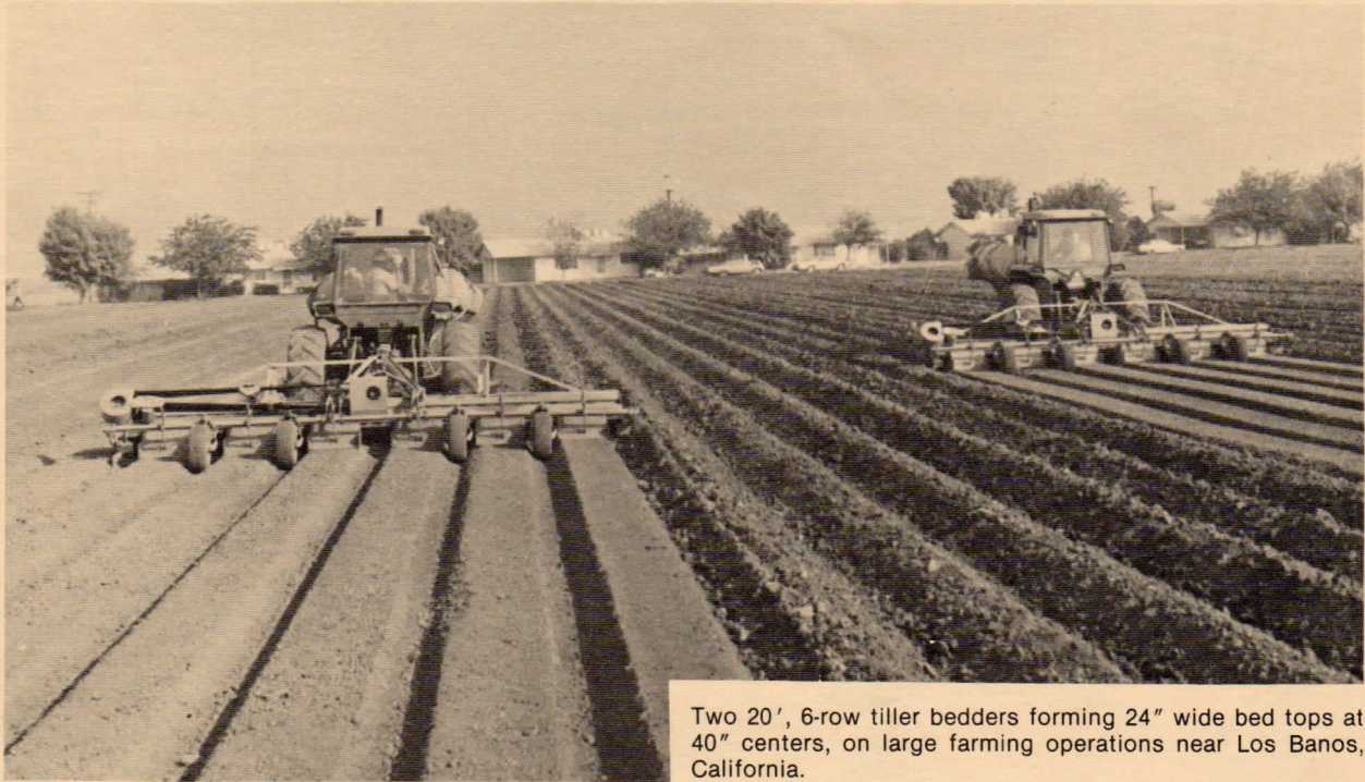
Two 20', 6-row tiller bedders forming 24" wide bed tops at 40" centers, on large farming operations near Los Banos, California.

As Used For The Bed Preparation Of Row Crops