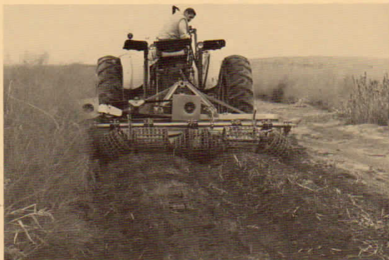
Here a Northwest RB Series is arranged for tilling, forming and firming beds for asparagus and other crops. This view is of a two row unit. Wider sizes may also be furnished.

The NORTHWEST Rotary Tiller may be adjusted to till to a uniform depth in both the top of the bed and the bottom of furrow. The mesh rollers are used to firm the top and sides of the bed and leave enough rough surface to retard wind erosion.