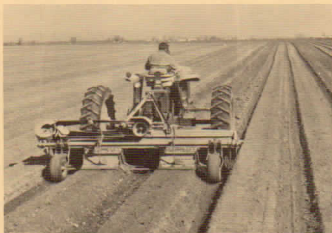
A two bed tiller is shown forming and tilling the top of the beds only.

NORTHWEST Rotary Tillers are available in sizes from 4' to 20' in width. The "RB" and "D" Series may be adapted for use in vineyards, row crop cultivation, strip tilling, hilling, chemical incorpora-