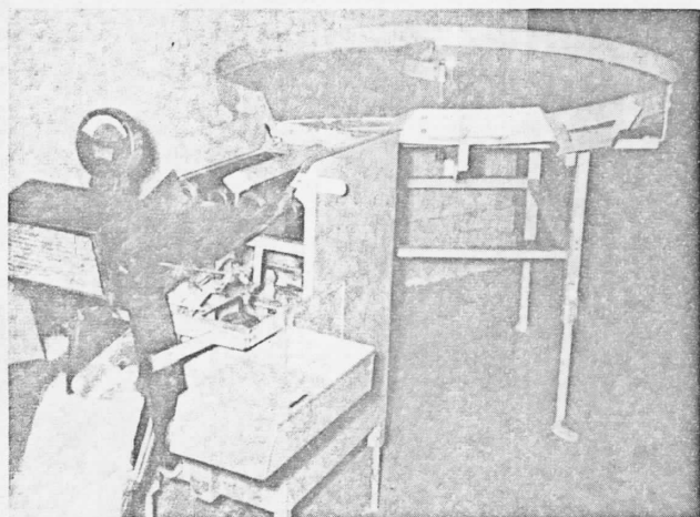
AUGERBAGGER WITH POLYETHYLENE BAGGING EQUIPMENT ATTACHED

Northwest Weight Augerbaggars cost much less than standard double head autobaggars yet more than double their production. Once again Northwest "sets the pace" for efficient low cost bagging equipment.