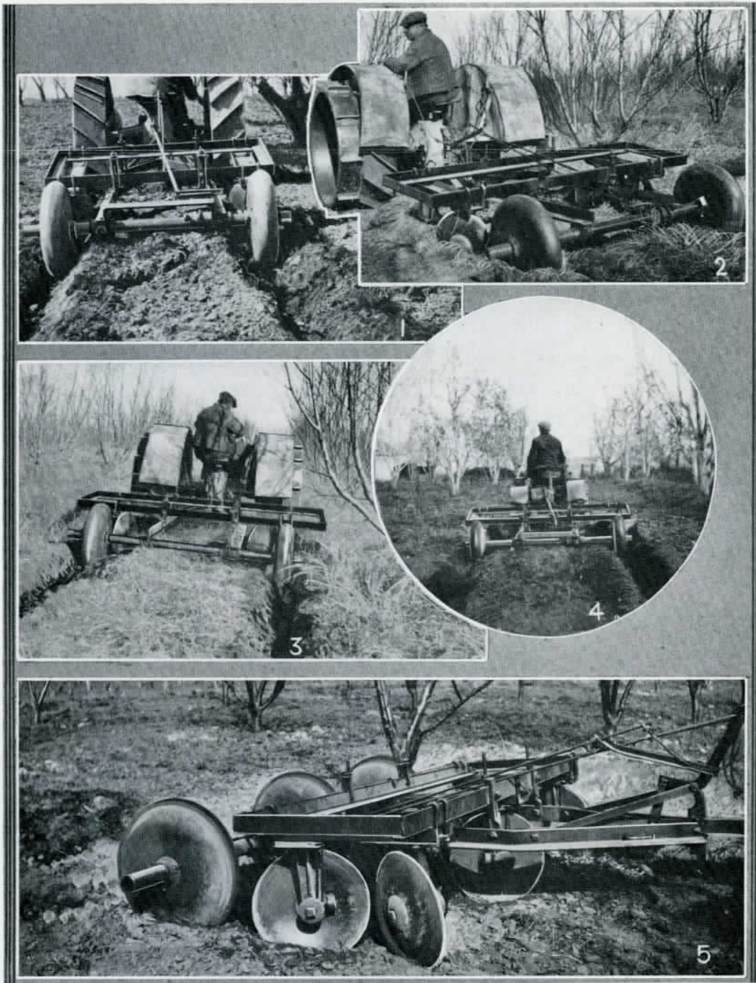
1—Lindeman Ditcher in clean cultivation. 2—A deep cut in heavy cover crop. 3—A clean ditch in sweet clover cover crop.